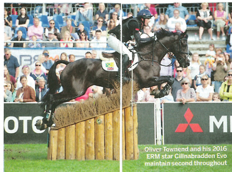
Oliver Townend and his 2016 ERM star Cillinbradden Evo maintain second throughout

the way I wished it to so I couldn't be happier," said the German rider. "He couldn't have gone better and to get the win on home soil is really something special."