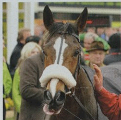
Kauto Star — 'a horse with so many gears'

I just love racing and I love fast horses. I don't think I'd have any problems controlling him cross-country either — I've ridden a lot worse.